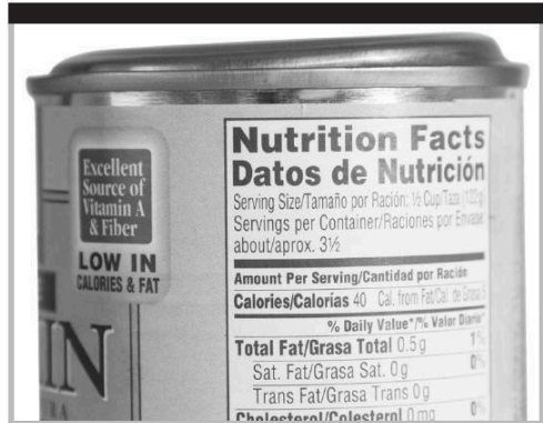
Swollen or bulging ends