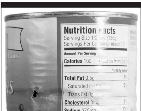
Holes or signs of leaking