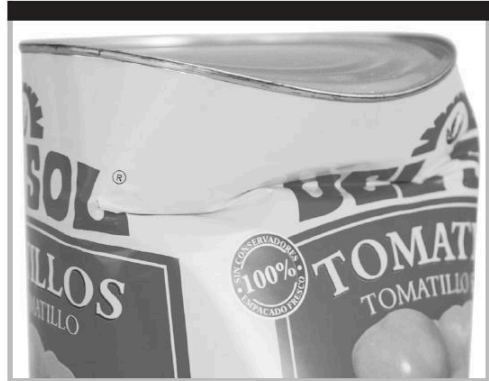
Deep dents in can body