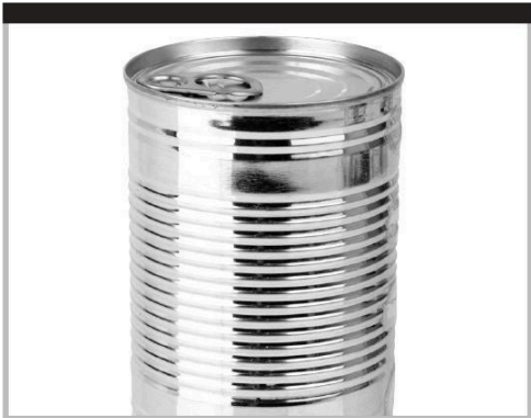
Missing or unreadable labels