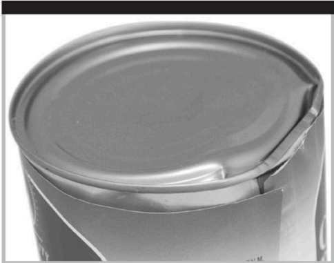
Severe dent in seam